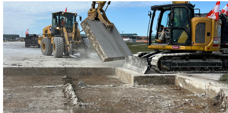
Pavement repairs at the Gerald R. Ford International Airport in Grand Rapids, Michigan, capturing pavement demolitions