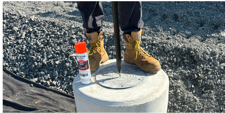
Taxiway reconstruction at the Rhode Island T.F. Green International Airport in Warwick, Rhode Island, capturing light cans

Posh and his team took a sensible approach to introducing GIS into their inspection process. Armed with a Trimble DA2 receiver and the Field Maps application, the inspections would capture one line item on two test projects: